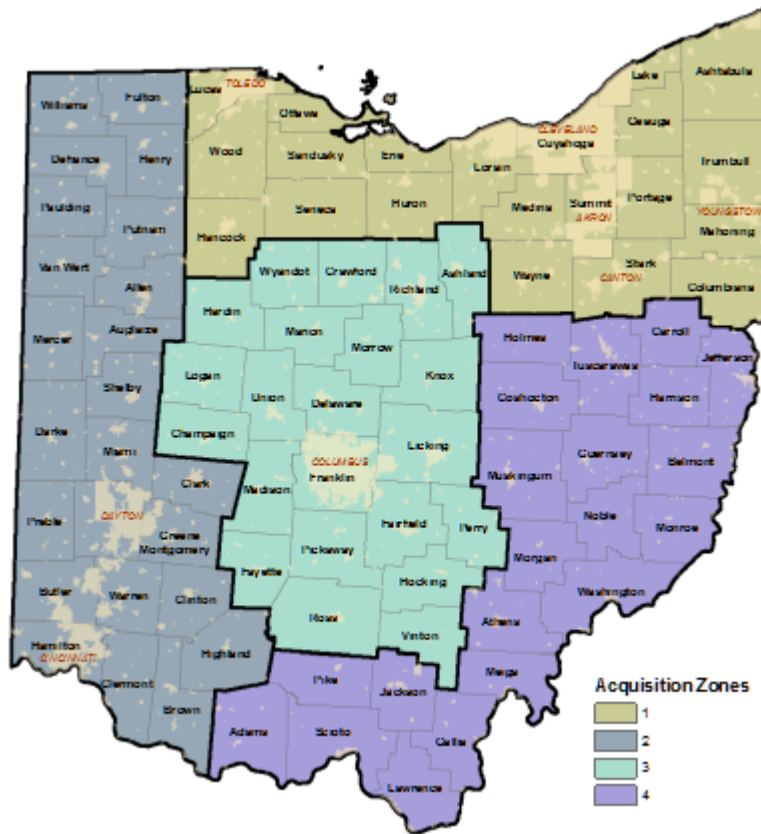
Figure 1-1 State Map Delineating Project Areas

Twenty-one (21) counties comprise the 2020 Southeastern Acquisition Area (~10,385.9 sq. mi.) include: ADAMS, ATHENS, BELMONT, CARROLL, COSHOCTON, GALLIA, GUERNSEY, HARRISON, HOLMES, JACKSON, JEFFERSON, LAWRENCE, MEIGS, MONROE, MORGAN, MUSKINGUM, NOBLE, PIKE, SCIOTO, TUSCARAWAS, WASHINGTON.