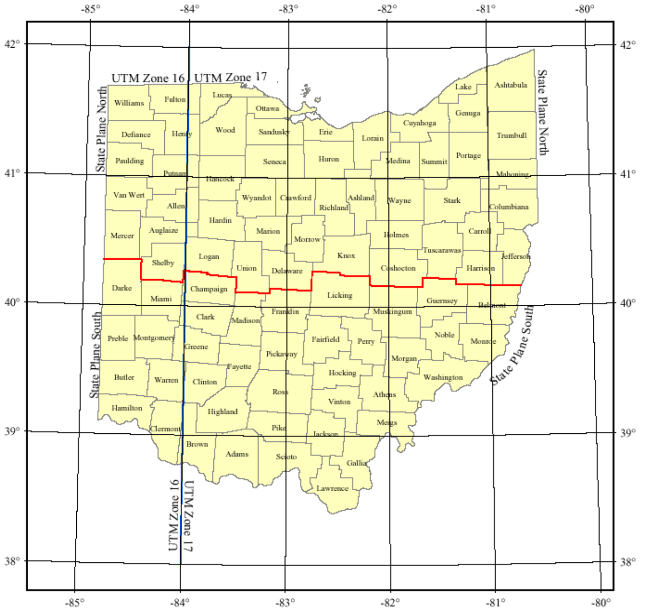
Figure 2-1 - Ohio State Plane and UTM Zone Boundaries

Horizontal Accuracy Requirements (Orthoimagery Products). The Contractor will be held strictly to specified horizontal accuracy for the required orthoimagery and optional project deliverables.